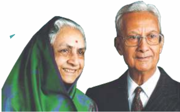
Late Dr. (Smt.) Sarala Birla & Syt. B.K. Birla