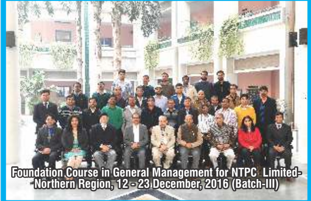
Foundation Course in General Management for NTPC Limited-Northern Region, 12-23 December, 2016 (Batch-III)