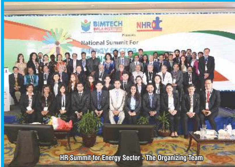
HR Summit for Energy Sector - The Organizing Team