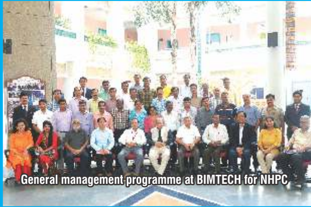
General management programme at BIMTECH for NHPC