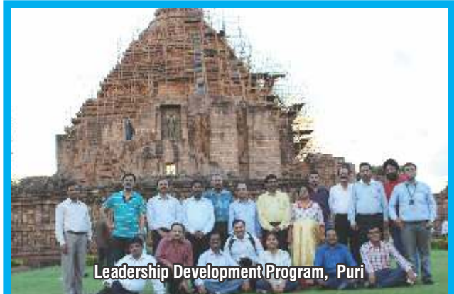
Leadership Development Program, Puri