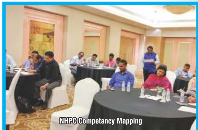
NHPC Competency Mapping