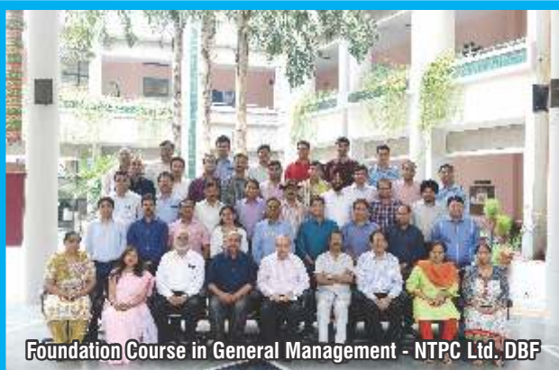
Foundation Course in General Management - NTPC Ltd. DBF