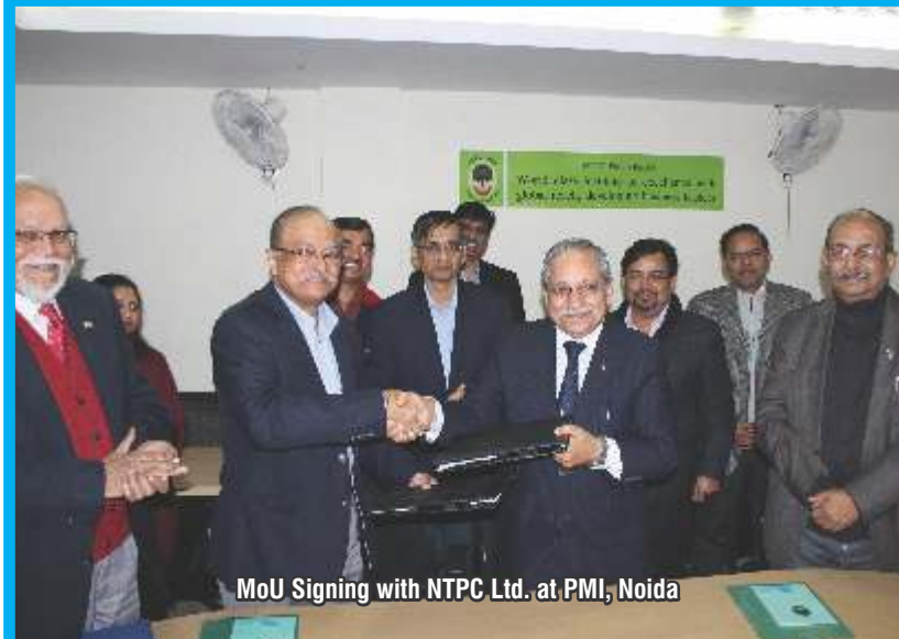
MoU Signing with NTPC Ltd. at PMI, Noida