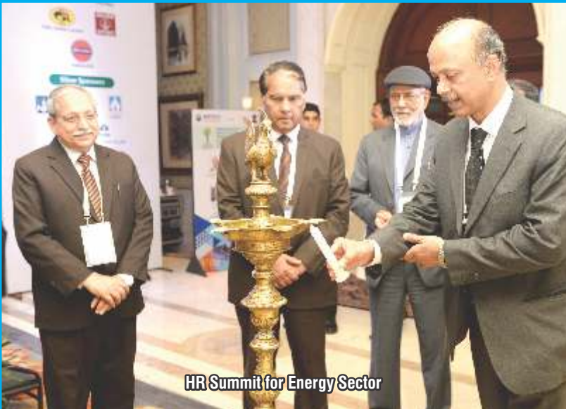
HR Summit for Energy Sector