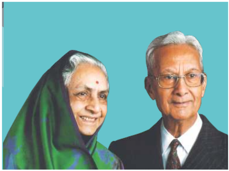
Late Dr. (Smt.) Sarala Birla & Syt. B.K. Birla