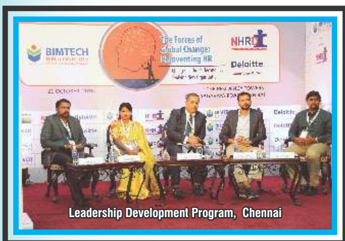
Leadership Development Program, Chennai