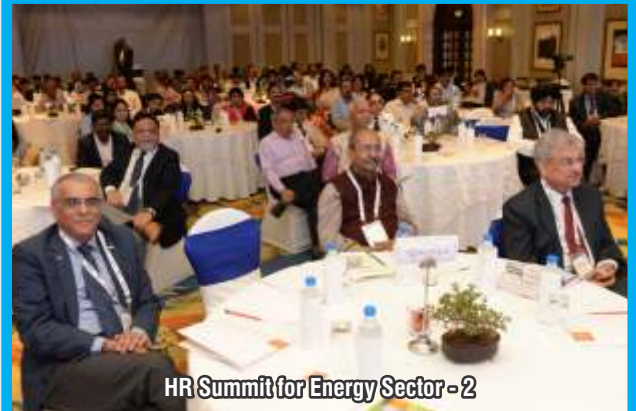
HR Summit for Energy Sector - 2