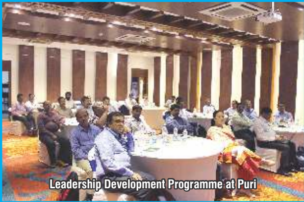
Leadership Development Programme at Puri