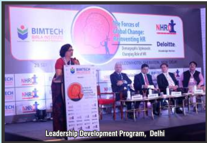
Leadership Development Program, Delhi