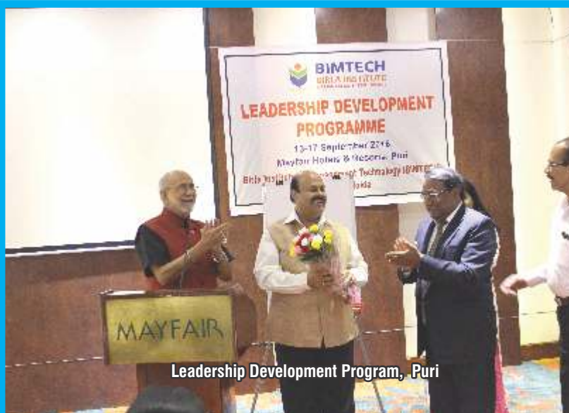
Leadership Development Program, Puri