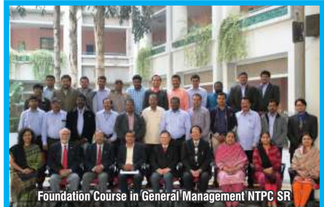
Foundation Course in General Management NTPC SR