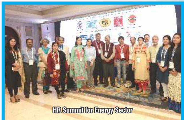
HR Summit for Energy Sector

तत्त्वज्ञानं सम्यक् मतिः आर्यप्रज्ञा सम्बोध इत्येकम् । न्या. भा. 4/1/4/पृ. 466