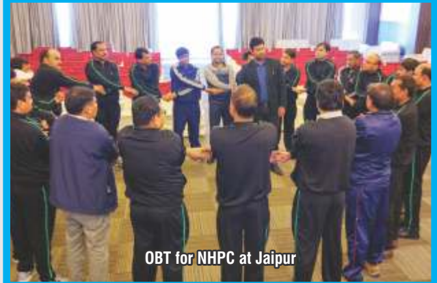
OBT for NHPC at Jaipur