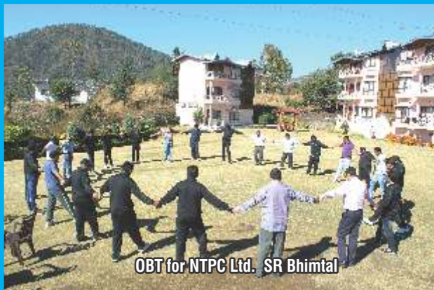
OBT for NTPC Ltd. SR Bhimtal