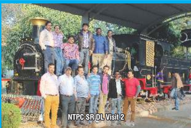
NTPC SR DL Visit 2