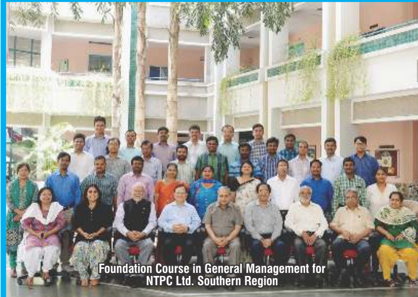
Foundation Course in General Management for NTPC Ltd. Southern Region