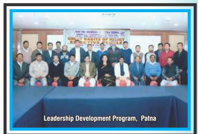
Leadership Development Program, Patna