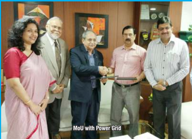
MoU with Power Grid