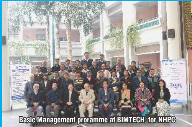
Basic Management programme at BIMTECH for NHPC