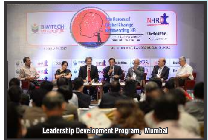
Leadership Development Program, Mumbai