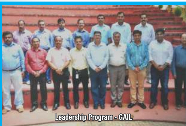
Leadership Program - GAIL