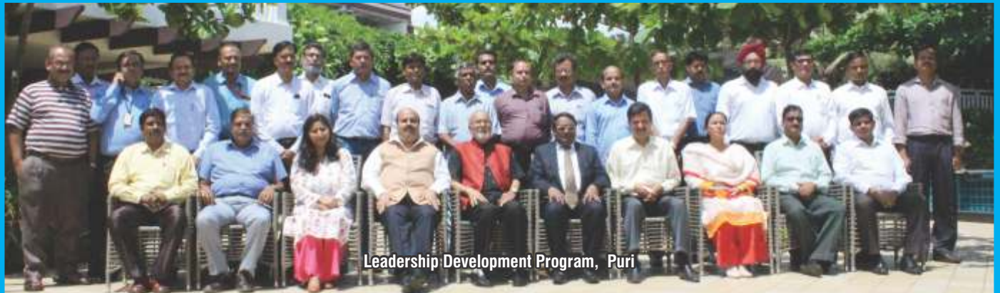
Leadership Development Program, Puri