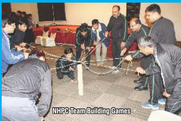
NHPC Team Building Games