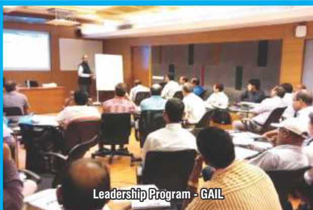
Leadership Program - GAIL