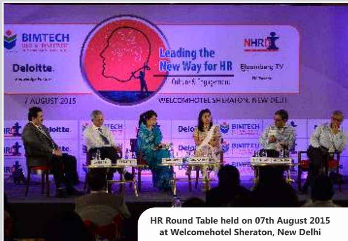
HR Round Table held on 07th August 2015 at Welcomehotel Sheraton, New Delhi