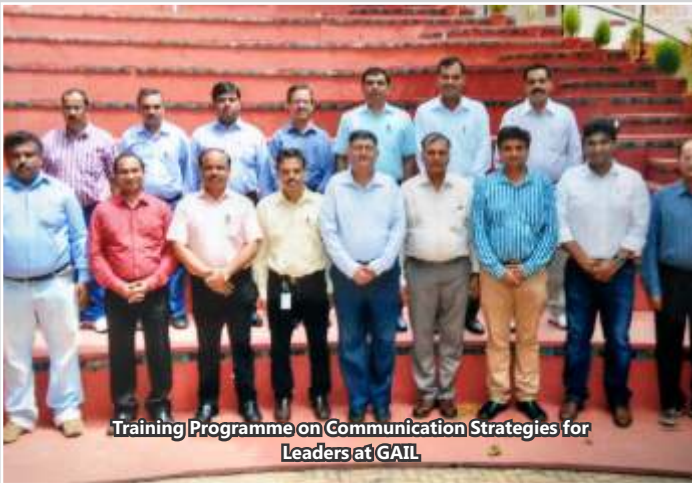
Training Programme on Communication Strategies for Leaders at GAIL