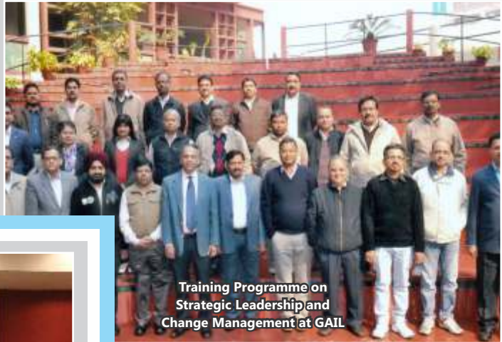
Training Programme on Strategic Leadership and Change Management at GAIL