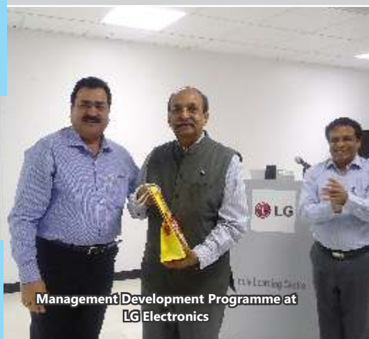
Management Development Programme at LG Electronics