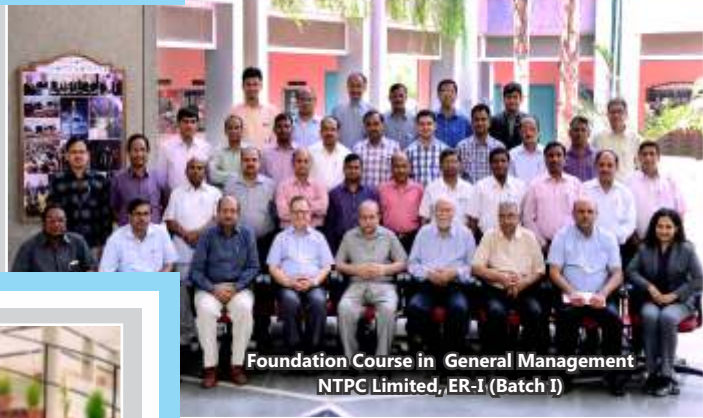
Foundation Course in General Management NTPC Limited, ER-I (Batch I)