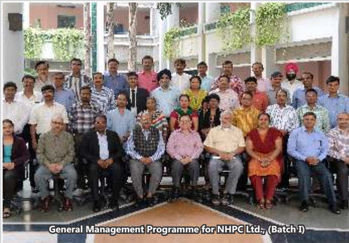
General Management Programme for NHPC Ltd., (Batch I)