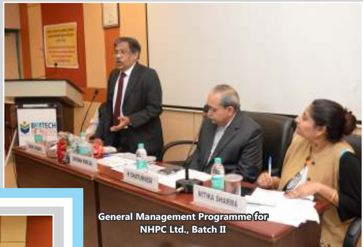
General Management Programme for NHPC Ltd., Batch II