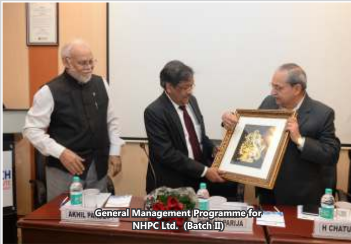
General Management Programme for NHPC Ltd. (Batch II)