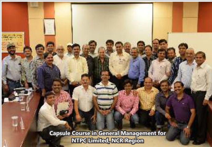
Capsule Course in General Management for NTPC Limited, NCR Region