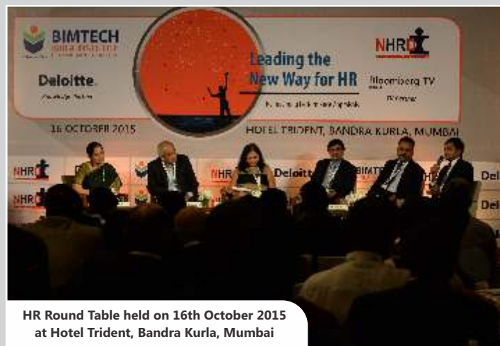
HR Round Table held on 16th October 2015 at Hotel Trident, Bandra Kurla, Mumbai