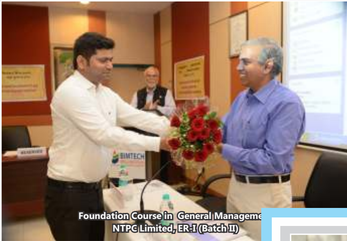
Foundation Course in General Management NTPC Limited, ER-I (Batch II)