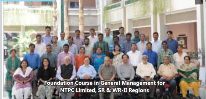
Foundation Course in General Management for NTPC Limited, SR & WR-II Regions