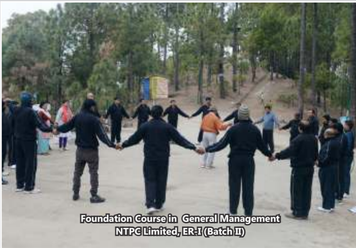
Foundation Course in General Management NTPC Limited, ER-I (Batch II)