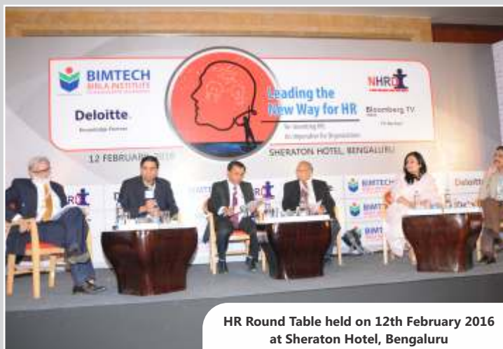
HR Round Table held on 12th February 2016 at Sheraton Hotel, Bengaluru