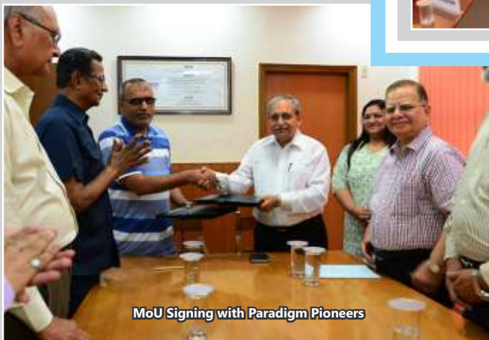
MoU Signing with Paradigm Pioneers