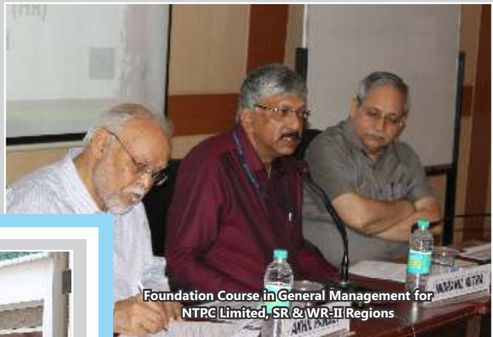
Foundation Course in General Management for NTPC Limited, SR & WR-II Regions