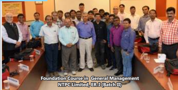
Foundation Course in General Management NTPC Limited, ER-I (Batch II)