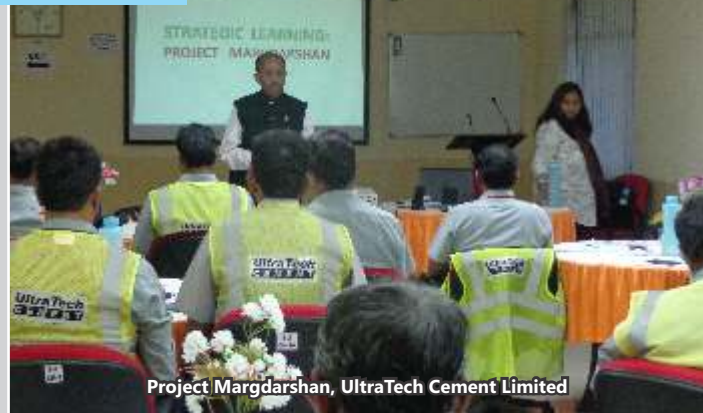
Project Margdarshan, UltraTech Cement Limited