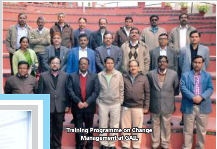
Training Programme on Change Management at GAIL