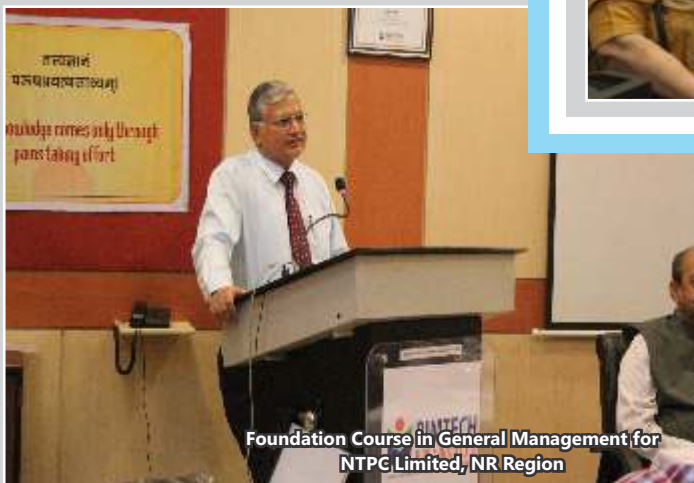
Foundation Course in General Management for NTPC Limited, NR Region