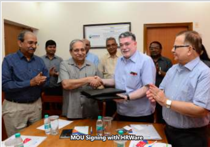
MOU Signing with HRWare