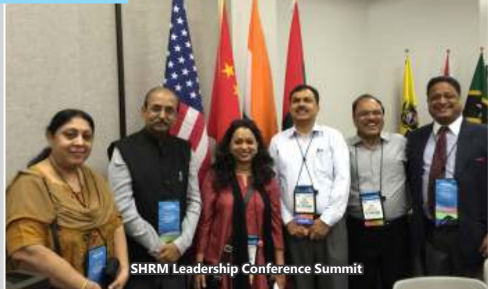
SHRM Leadership Conference Summit