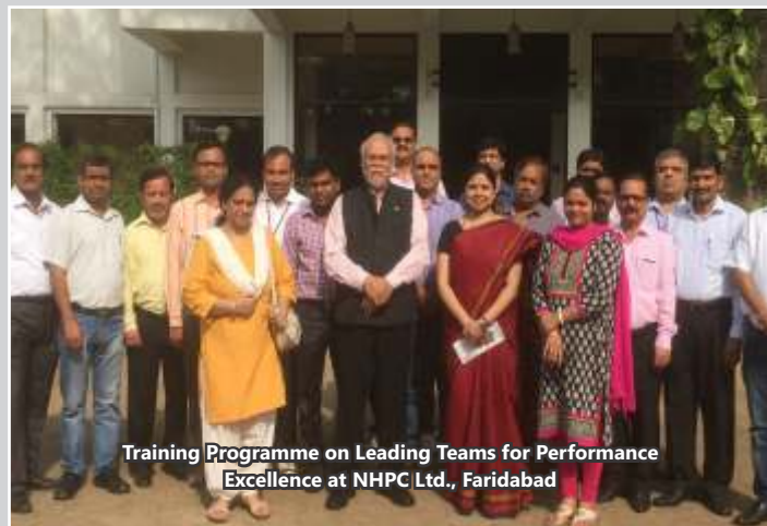
Training Programme on Leading Teams for Performance Excellence at NHPC Ltd., Faridabad