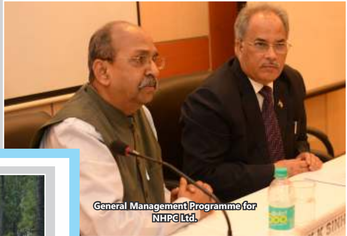
General Management Programme for NHPC Ltd.