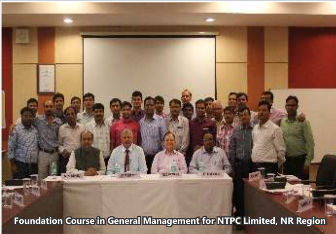
Foundation Course in General Management for NTPC Limited, NR Region