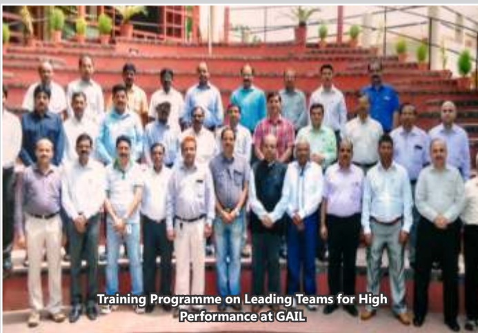
Training Programme on Leading Teams for High Performance at GAIL