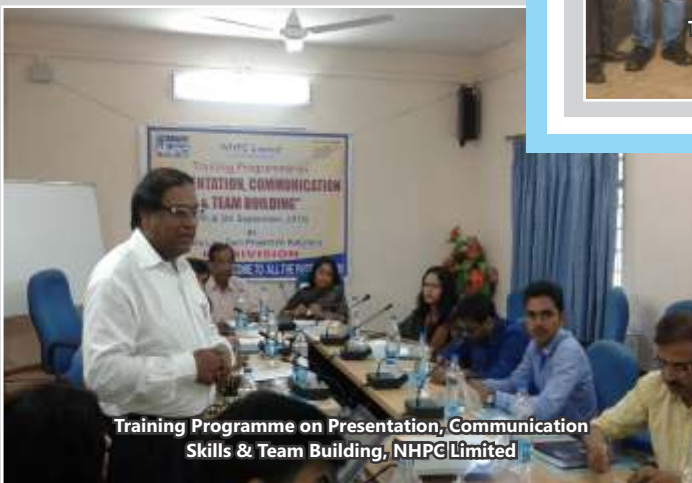
Training Programme on Presentation, Communication Skills & Team Building, NHPC Limited