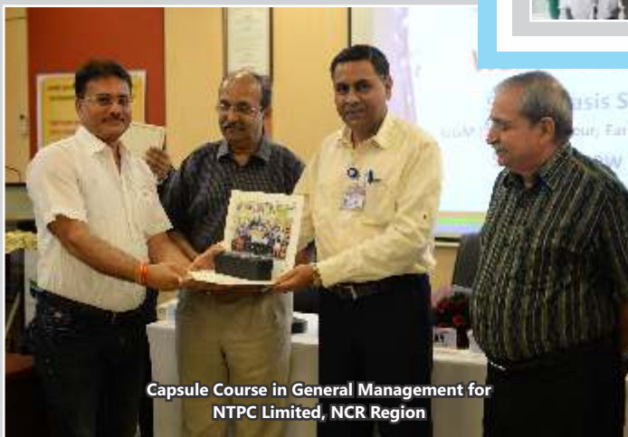
Capsule Course in General Management for NTPC Limited, NCR Region