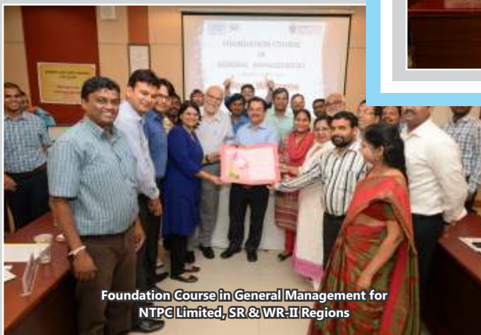
Foundation Course in General Management for NTPC Limited, SR & WR-II Regions