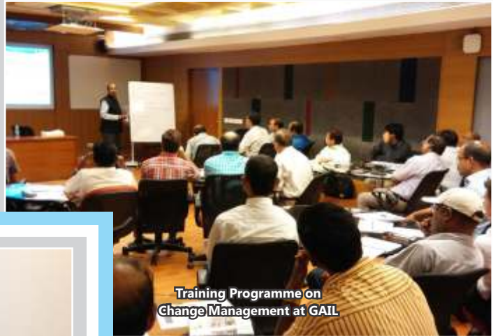
Training Programme on Change Management at GAIL