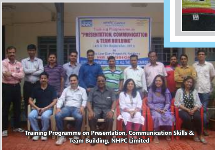
Training Programme on Presentation, Communication Skills & Team Building, NHPC Limited