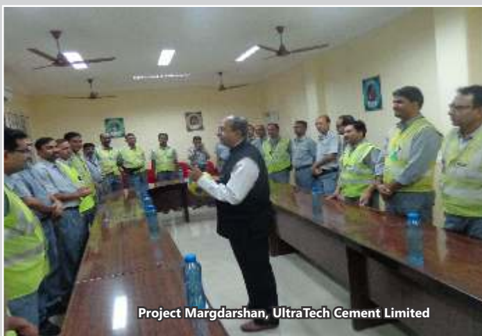
Project Margdarshan, UltraTech Cement Limited