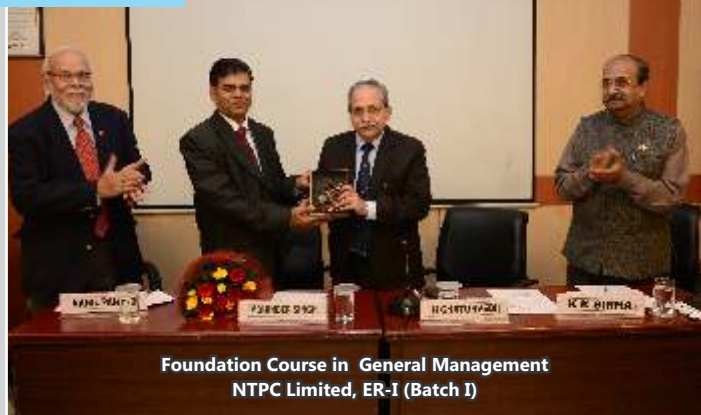
Foundation Course in General Management NTPC Limited, ER-I (Batch I)