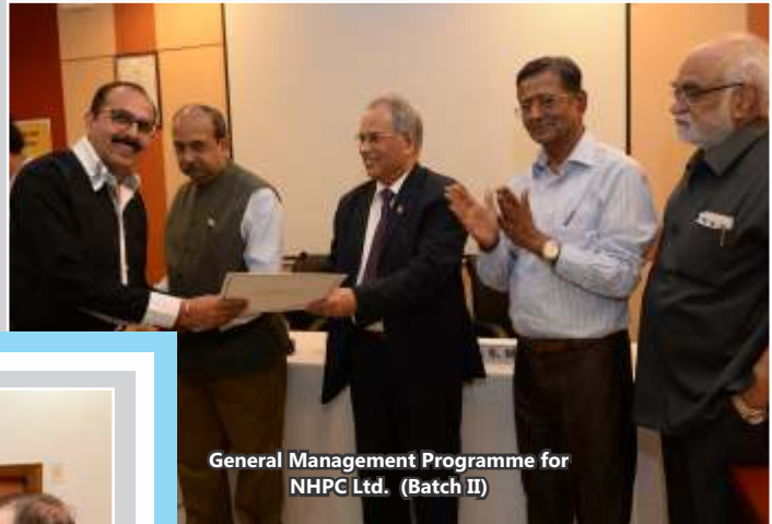
General Management Programme for NHPC Ltd. (Batch II)