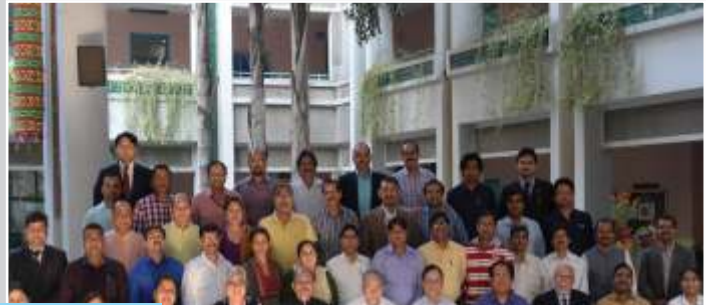
General Management Programme for NHPC Ltd. (Batch II)