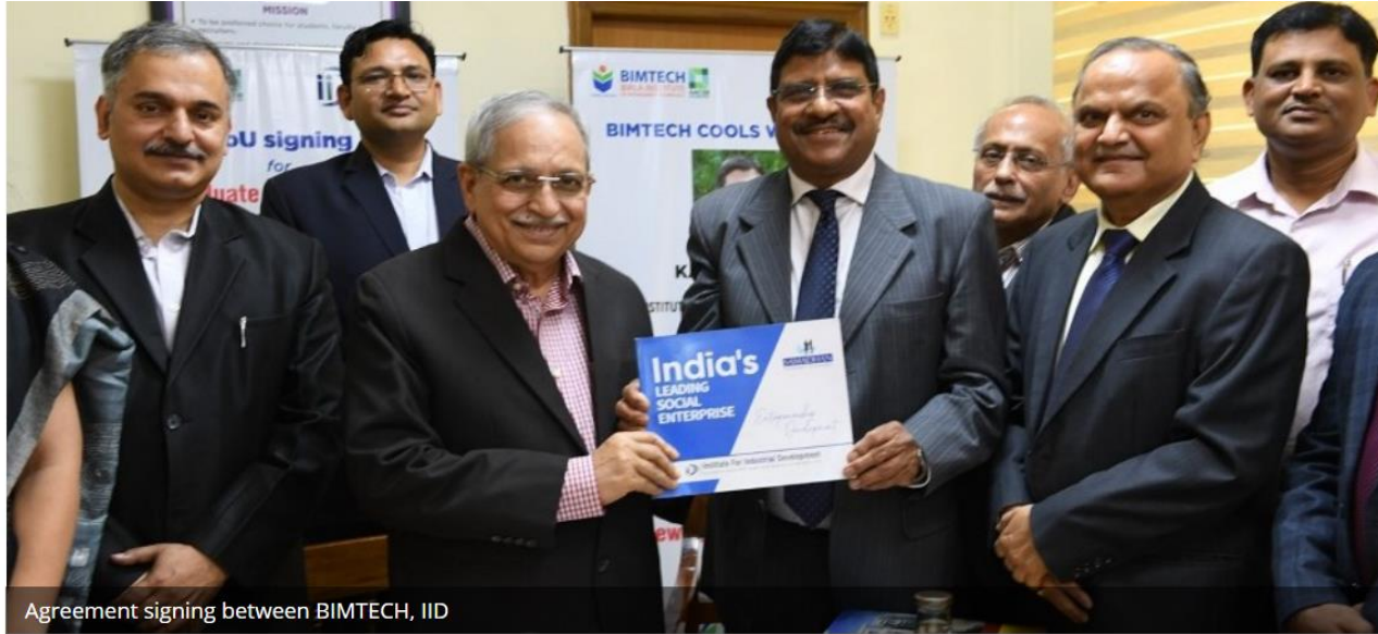
Agreement signing between BIMTECH, IID