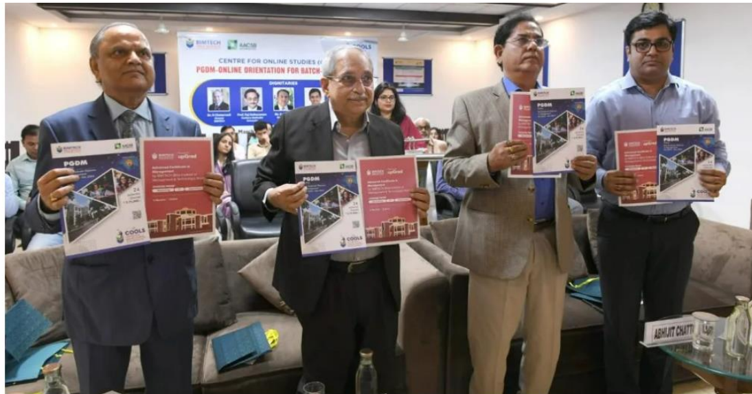
The programme aims to provide students with digital skills, and knowledge of corporate expectations.

The programme aims to provide students with the essential communication, digital skills, and knowledge of corporate expectations necessary to excel in their academic pursuits.