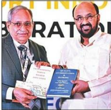
इंडिया एक्सपो मार्ट में स्टार्टअप कुंभ में आर प्रदेश के विज्ञान एवं सूचना प्रौद्योगिकी मंत्री।