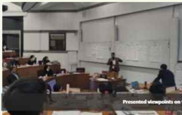
Presented viewpoints on the purpose of the teaching case